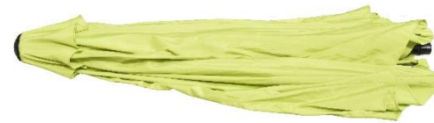
Umbrella Canopy x 1